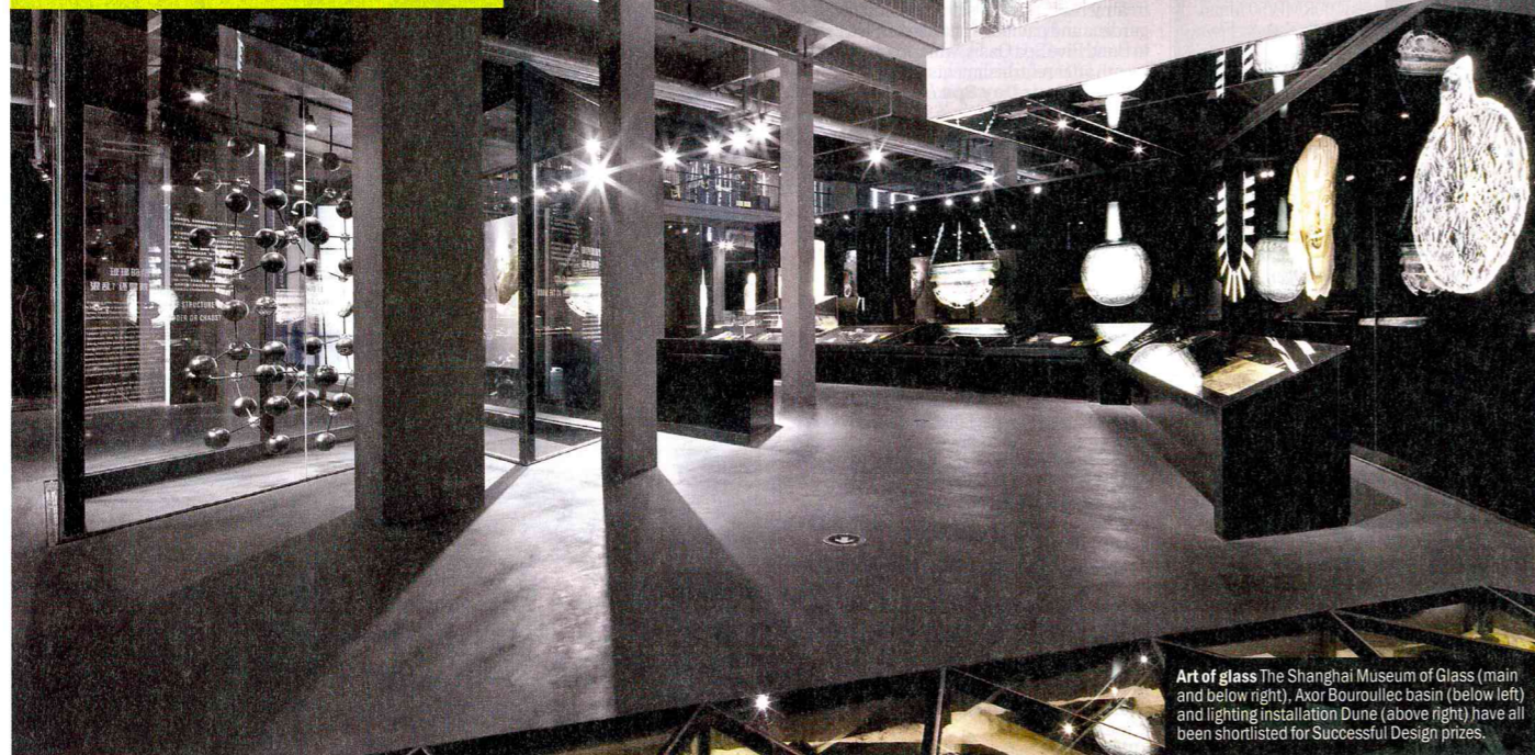
Art of glass The Shanghai Museum of Glass (main and below right), Axor Bouroullec basin (below left) and lighting installation Dune (above right) have all been shortlisted for Successful Design prizes.